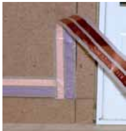
The second fold is toward the new direction.