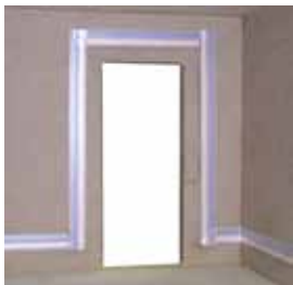
Do Not eyelet a folded corner