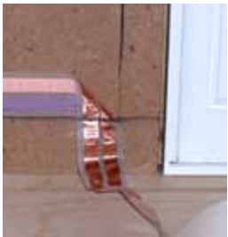
The first fold is away from the new direction.

○ “Folded Corners” are pleated re-directs that go around doors or windows.